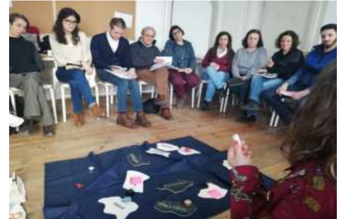
Presentation the competences and programms mapping Gato Vadio Bookshop June, 2019