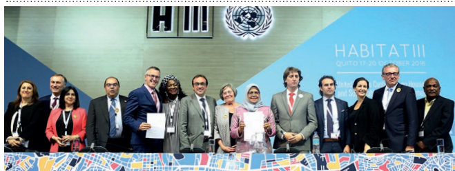
Second panel on the local and regional governments' commitments