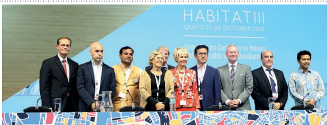
First panel on the local and regional governments' commitments