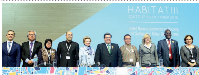
Panel on local and regional governments' response to the New Urban Agenda