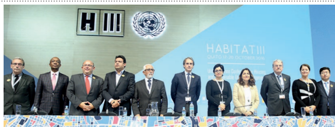
Third panel on the local and regional governments' commitments