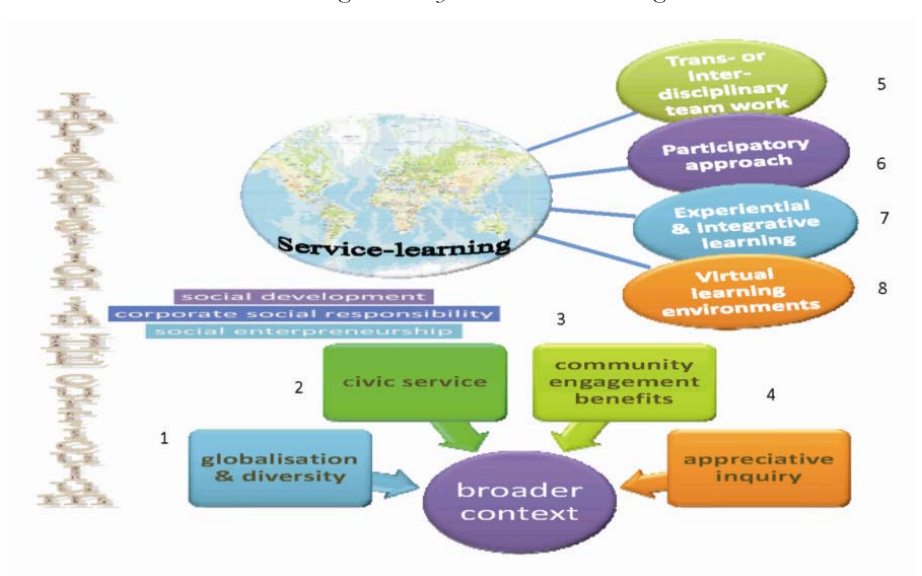
Figure 1: An illustration of various concepts bringing together a focus on meeting community needs and HE teaching