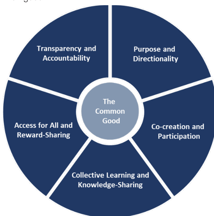
Figure 2. The common good

A revived approach to the common good, posited as a collective objective rather than a correction, focuses as much on the ‘how’ as the ‘what’. It can be guided by a market-shaping view of government, driven by public value. The first pillar, purpose and directionality , can promote outcomes-oriented policies that are in the common interest. The second pillar, co-creation and participation , allows citizens and stakeholders to participate in debate, discussion and consensus-building that bring different voices to the table. The third pillar, collective learning and knowledge-sharing , can help design true purpose-oriented partnerships that drive collective intelligence and sharing of knowledge. The fourth pillar, access for all and reward-sharing , can be a way to share the benefits of innovation and investment with all the risk takers, whether through equity schemes, royalties, pricing or collective funds. The fifth pillar, transparency and accountability , can ensure public legitimacy and engagement by enforcing commitments amongst all actors and by aligning on evaluation mechanisms.