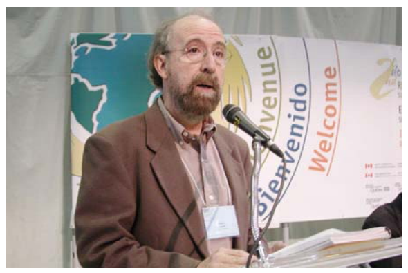
d'Afrique noire (IFAN) of Senegal.

As president of the Groupe d'économie solidaire du Québec (GESQ), I am pleased to present this Comprehensive Report of the Second International Meeting held in Quebec City in October 2001 in colloboration with the Grupo Red de Economia solidaria de Perù (GRESP), who organized the First Meeting, the Inter-réseaux de l'économie solidaire (IRES) of France, and the Institut fondamental