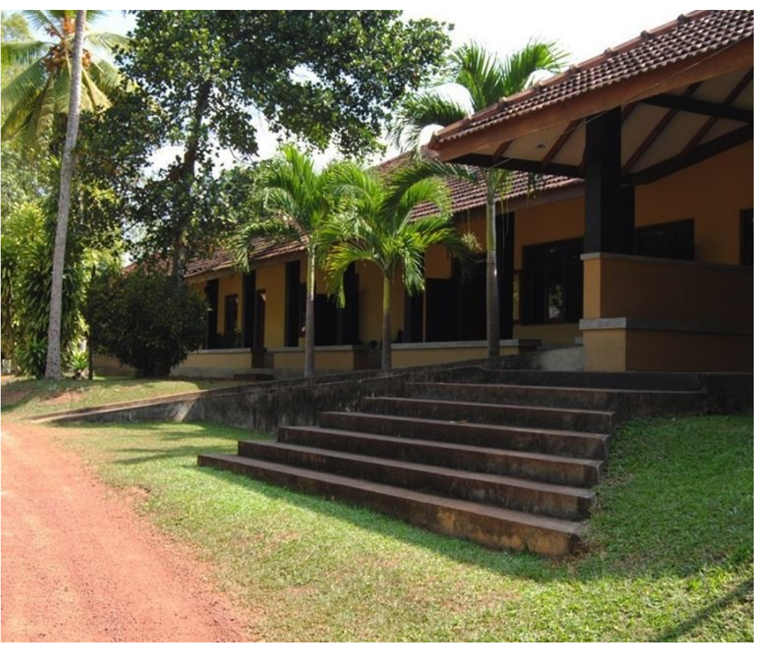
Sarvodaya – Thanamalwila Farm Bandaragama