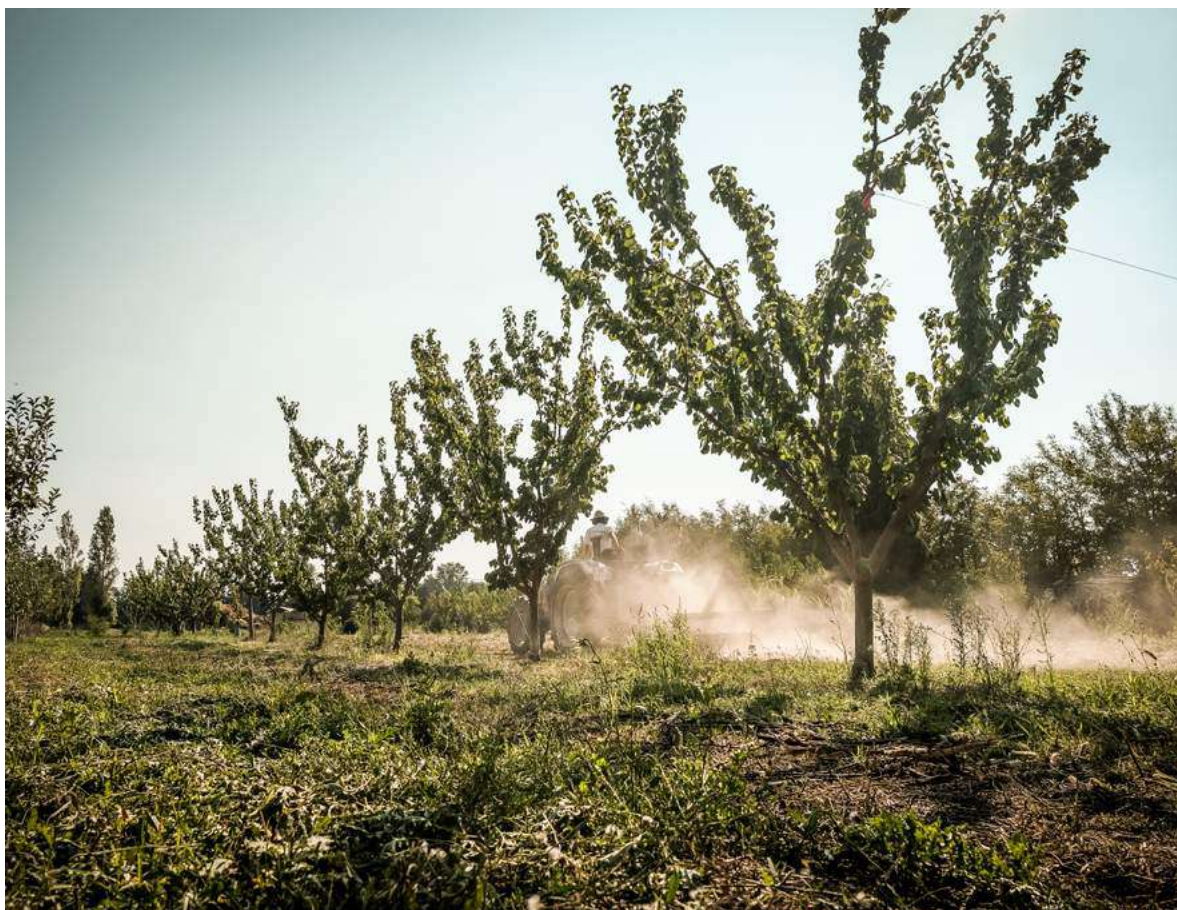
Reportage La Durette

However, these innovative and grassroots solutions are often obscured in over-simplified public conversations around agriculture, and must be supported by policy-makers at every level in order to reach their full potential . This report aims to show some critical policies and practices which can be put in place to support agroecological peasant farmers’ access to land, and therefore support them in implementing their solutions for more resilient and democratic food systems, sustainable livelihoods, flourishing rural and urban communities, and healthy and sustainable food for all.