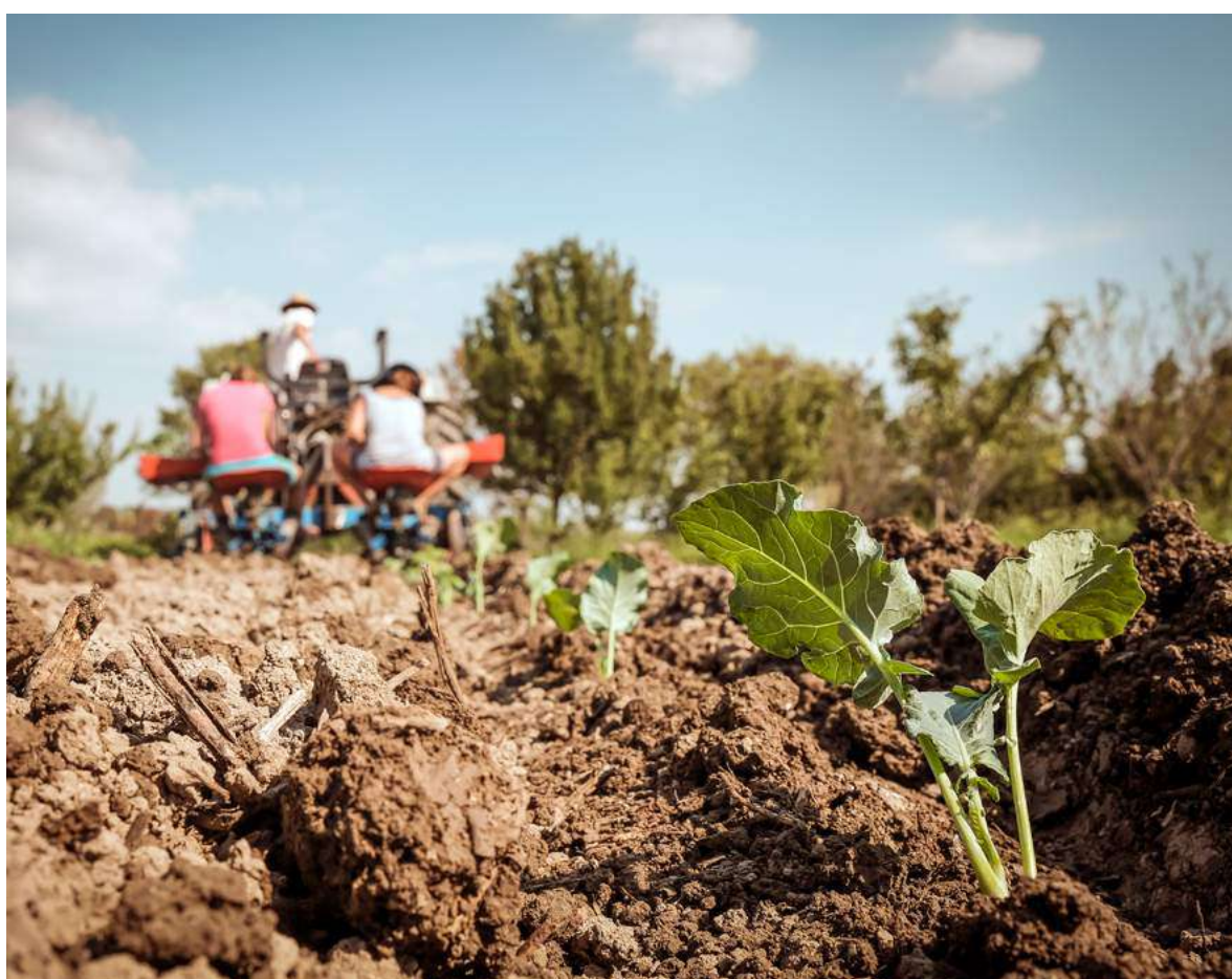
Reportage La Durette

Meanwhile, a thriving ecosystem of policy alternatives is taking root across Europe. From the level of individual farmers and community-level innovations, to local authorities and regional projects to nourish resilient and sustainable food systems built around small-scale agroecological farms, to an ever-growing number of proposals for genuine transformation at the national and EU level, policy-makers across Europe have the power and the opportunity to support a new and transformative vision.