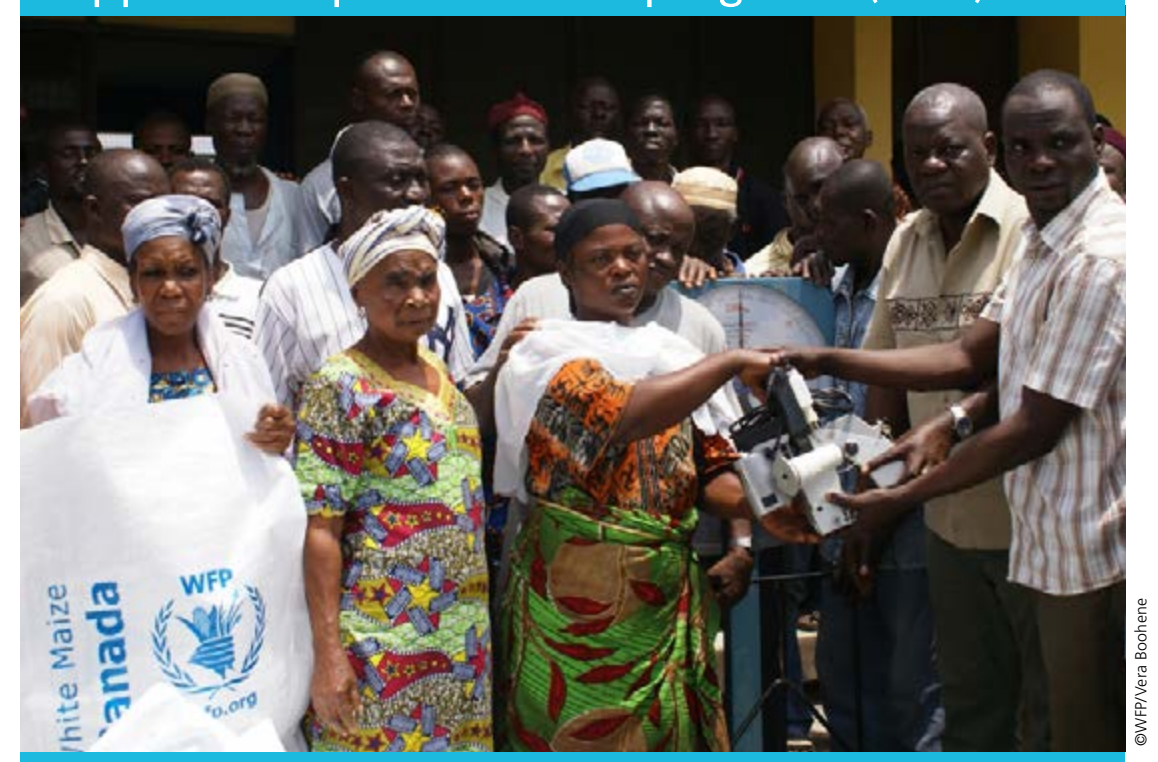
GHANA - Ashanti and Northern regions