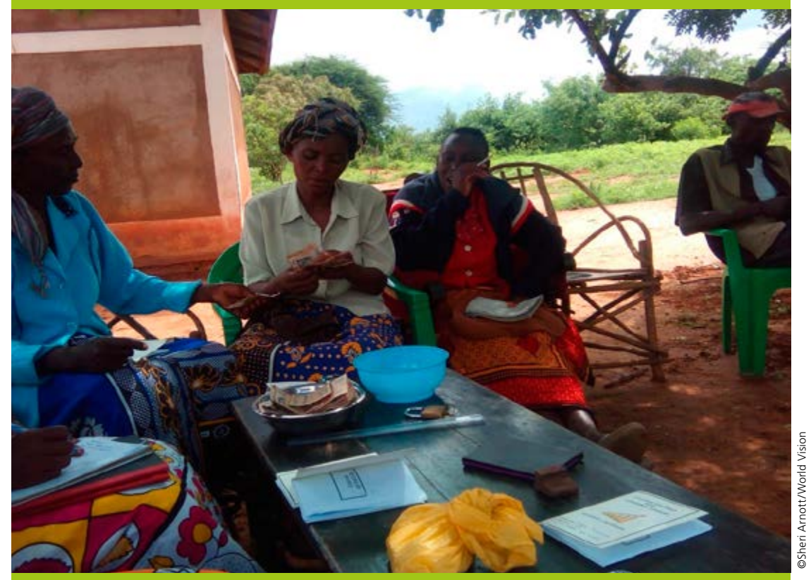
KENYA – Taita Taveta, Kilifi and Makueni Counties