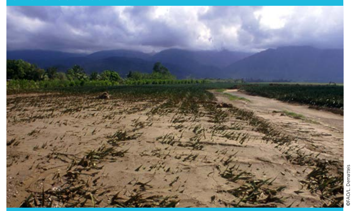
HONDURAS - All 18 departments nationwide