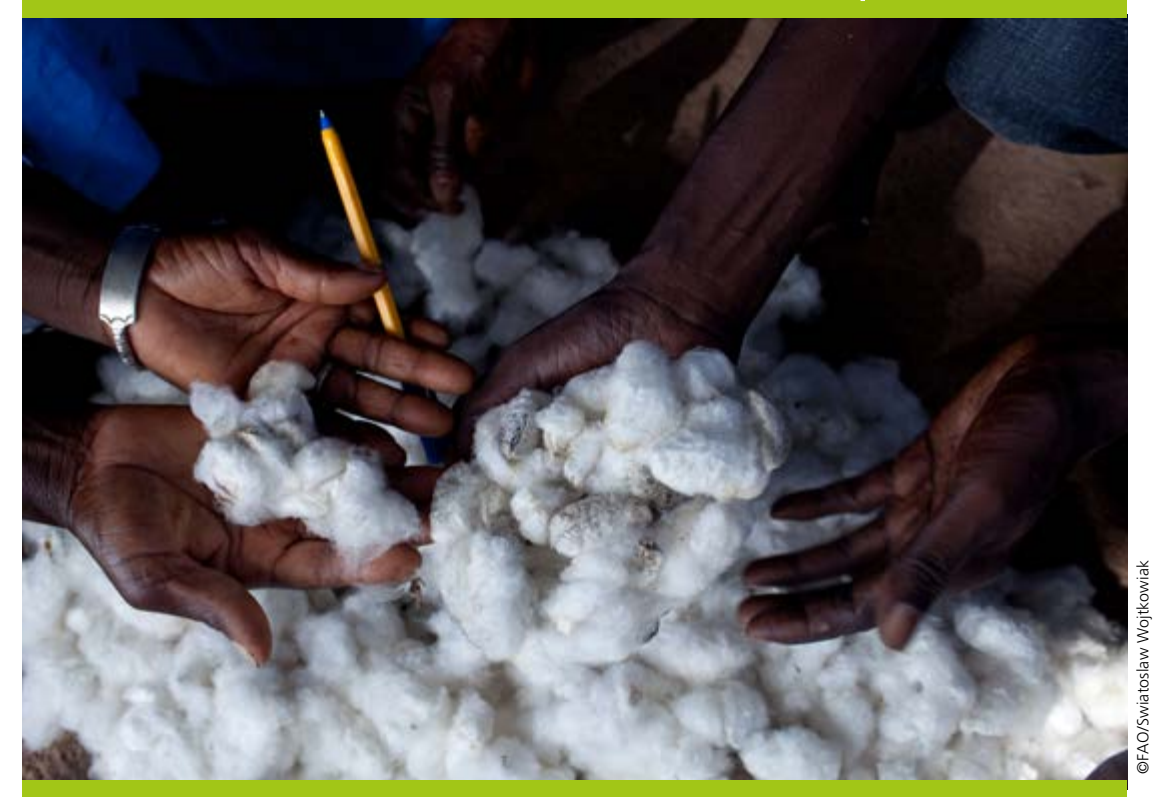
BURKINA FASO -28 cotton-producing provinces (the Western provinces, part of the Centre, and the provinces of East and Southeast)