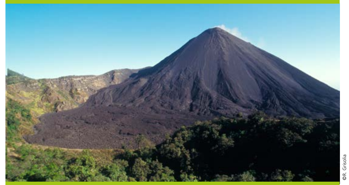
GUATEMALA — Departments of Alta Verapaz (municipalities of Cobán, San Pedro Carchá, Senahu, Santa Catalina la Tinta, Cahabón, Lanquin, Chisec) and Baja Verapaz (municipality of Purulhá)