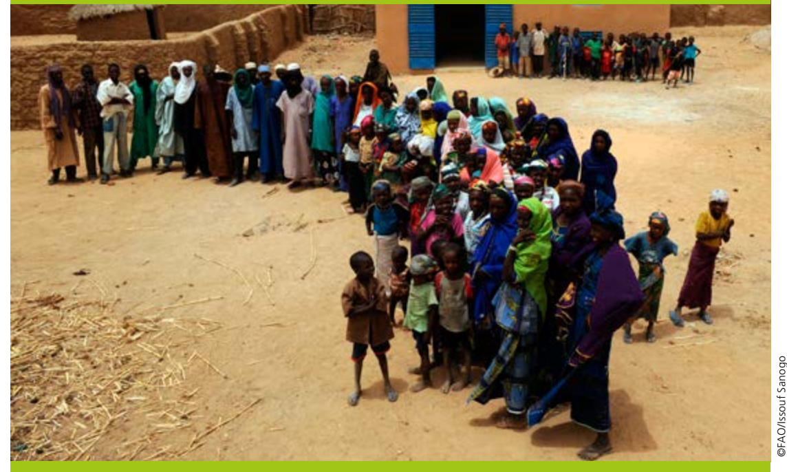
THE NIGER - Dosso region (Falwel district in Loga department)