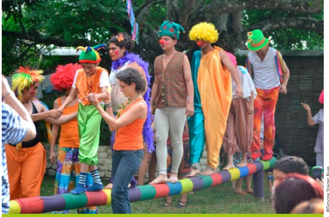
COLOMBIA - Peri-urban area of Calí