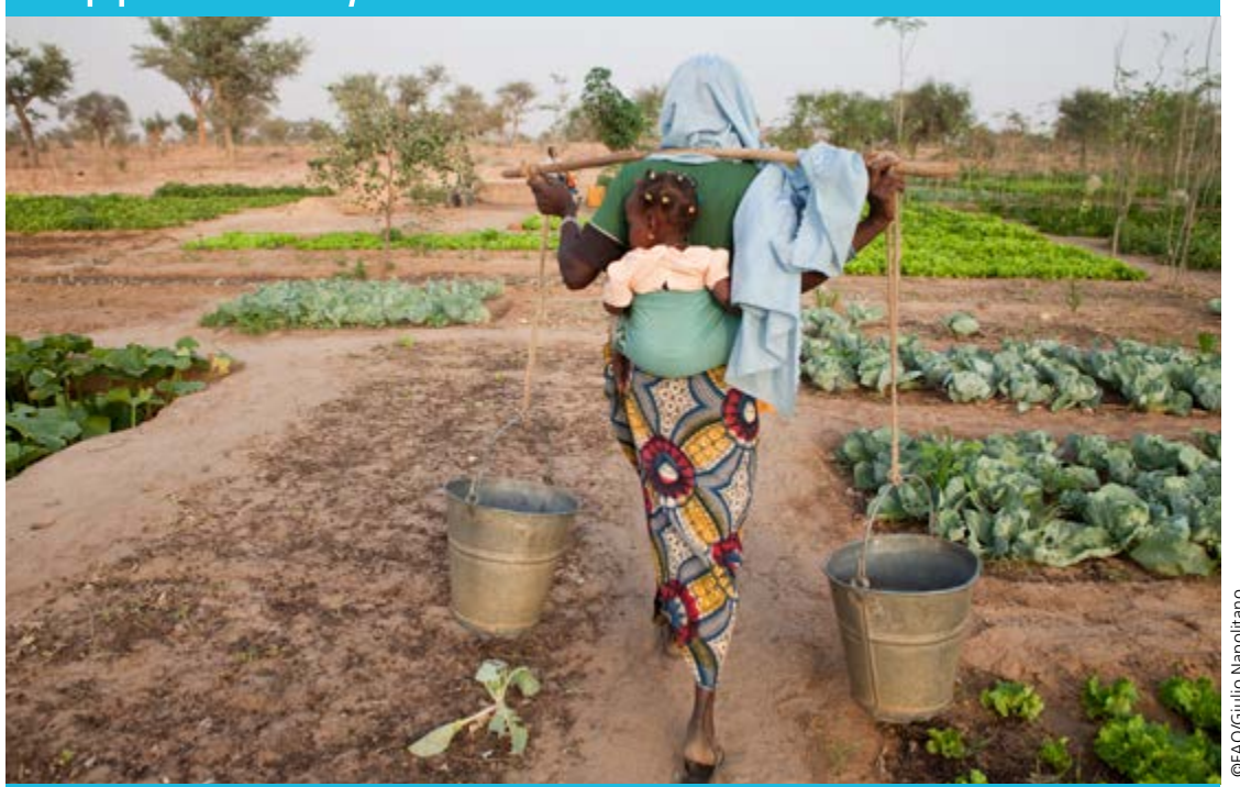
THE NIGER — Region of Maradi (departments of Maiyhi, Dakoro and Guidan Roundji; towns of Koran Habjia, Kornaka and Chadakori)