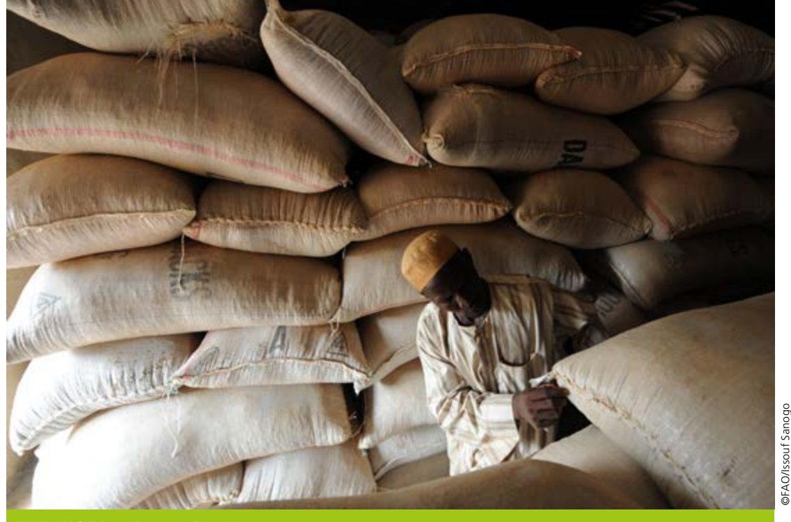
THE NIGER - Dosso Region