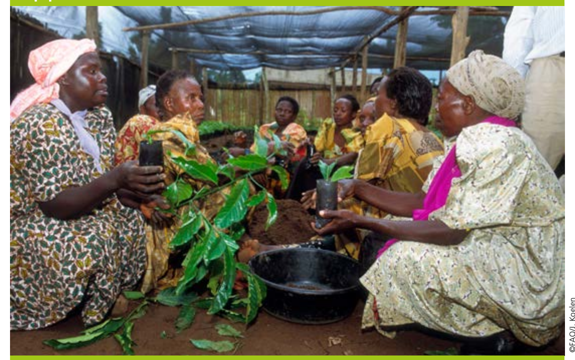
UGANDA — Karamoja region (districts of Kaabong, Kotido, Moroto, Amudat, Napak, Abim and Nakapripirit)