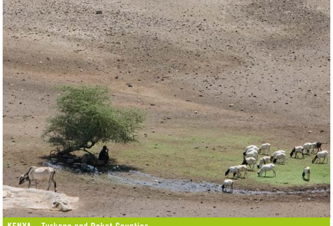
KENYA – Turkana and Pokot Counties