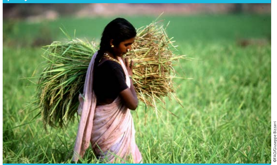
INDIA - Andhra Pradesh (22 districts)