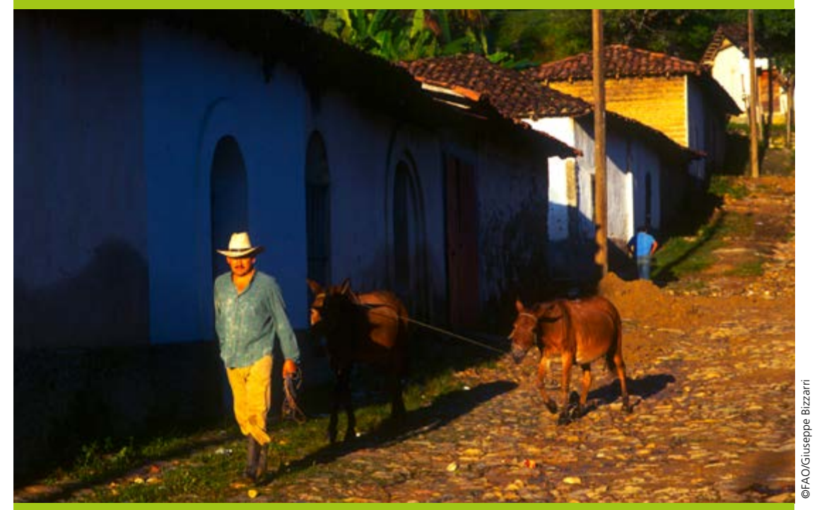
{ m HONDURAS}-28 communities in the four municipalities of San José, San Isidro, San Antonio de Flores and Pespire, in the Department of Choluteca