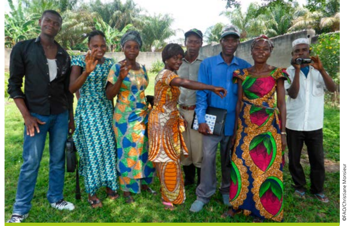
THE DEMOCRATIC REPUBLIC OF THE CONGO - Yanonge