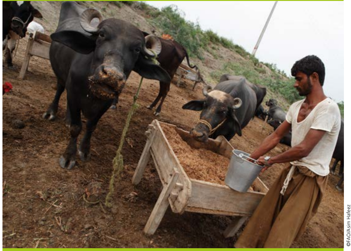
PAKISTAN - Areas of the Soon Valley, Noorpur Thal and Katha in Khushab District